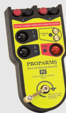
P2 Blasting Machine