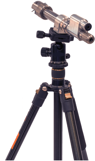
12.5 mm Neutrex Disrupter on Tripod