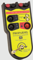
P2 Blasting Machine