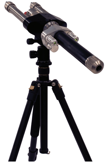
20mm RC MKIII Disrupter on Tripod