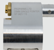
20mm Single Laser Pointer