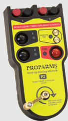
P2 Blasting Machine