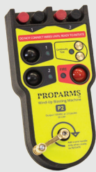
P2 Blasting Machine