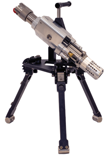
29mm Neutrex Disrupter on Stand