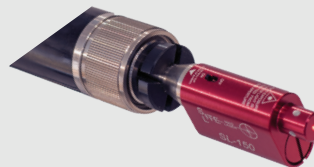
Bore Sight Laser