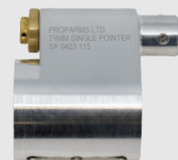
29mm Single Laser Pointer