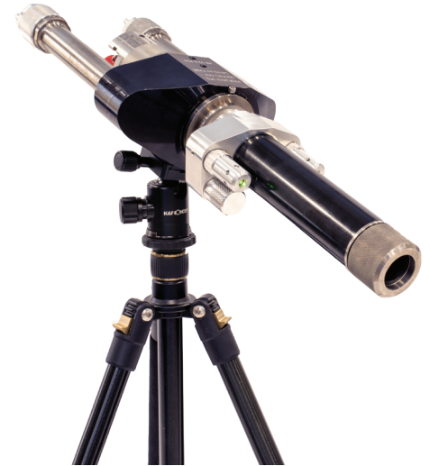
29mm RC XLT Disrupter on Tripod