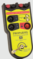
P2 Blasting Machine