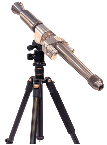
Wizard Recoilless Disrupter on Tripod