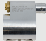
20mm Single Laser Pointer